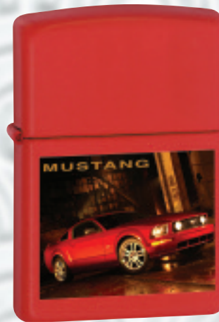
No. 20944 Mustang Full View Red Matte Suggested Retail: $27.95