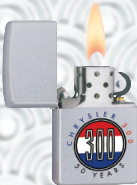
No. 20982 Chrysler 300 50 Years Satin Chrome Suggested Retail: $22.95