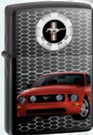
No. 20974 Mustang Front View Black Ice Suggested Retail: $39.95

Long considered to be the heart and soul of Ford cars, the Mustang continues to symbolize strength and freedom. Now the motorsports legend is available on the legendary windproof lighter, consecutively numbered and limited to 5000 pieces worldwide. Restrictions may apply.