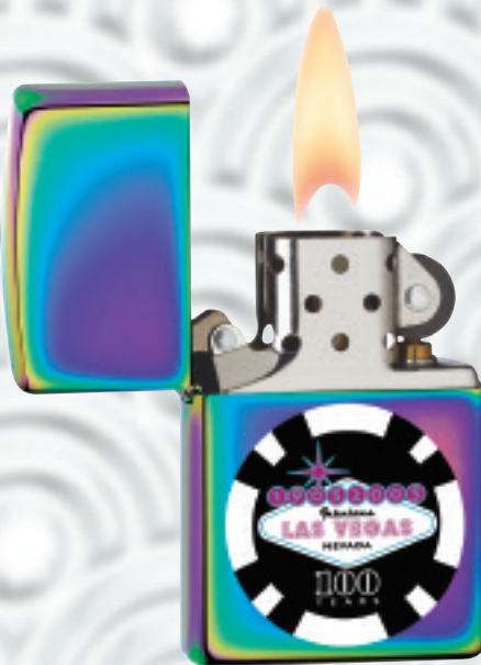
No. 20996 Las Vegas 100 - Ante Up Spectrum Suggested Retail: $27.95