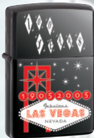
No. 20997 Las Vegas 100 Years Black Ice Suggested Retail: $29.95

Resplendent with lights, shows, glitz and glamour, Las Vegas is partying all year to commemorate its 100-year anniversary. The city's quintessential landmark, reproduced on two stunning PVD finish Zippo lighters, heralds the centennial celebration.