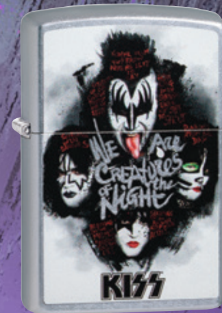
49018 STREET CHROME™ COLOR IMAGE $24.95

© 2019 KISS Catalog, Ltd. Under License to Epic Rights.