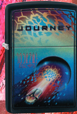
49029 BLACK MATTE COLOR IMAGE $31.95