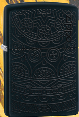
29989 BLACK MATTE COLOR IMAGE $24.95