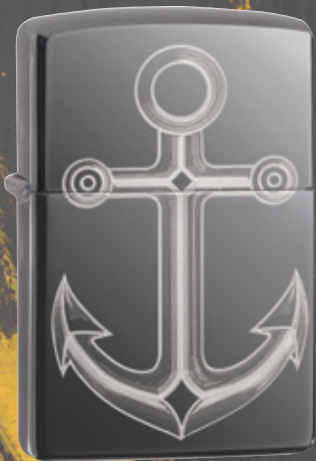
49028 BLACK ICE® LASER FANCY FILL $31.95