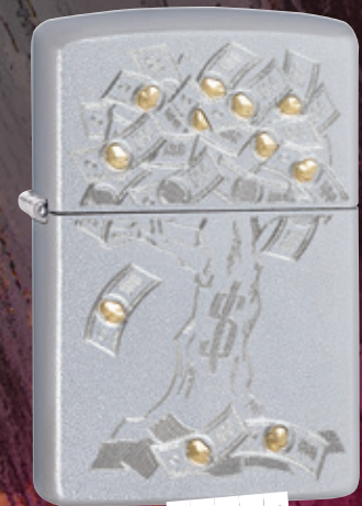
29999 SATIN CHROME AUTO TWO TONE $22.95