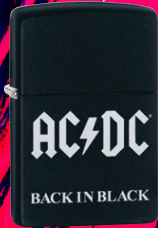
49015 BLACK MATTE COLOR IMAGE $28.95