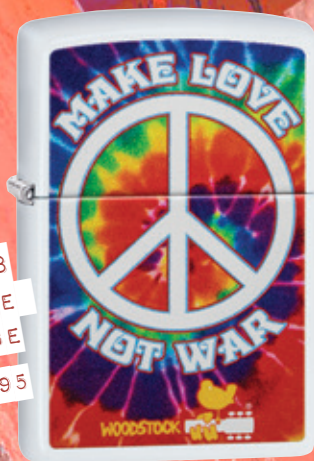
49013 WHITE MATTE COLOR IMAGE $30.95

© 2019 Cypress Hill Musik. Under License to Epic Rights.