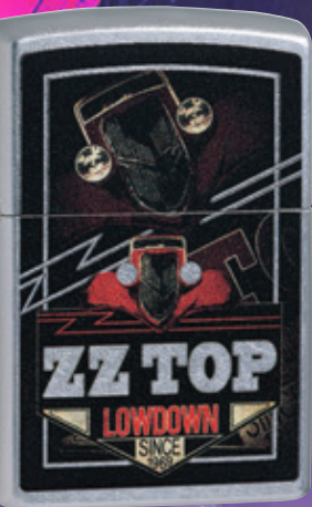
49008 STREET CHROME™ COLOR IMAGE $24.95

© 2019 Bludgeon Riffola Limited. Under License to Epic Rights.