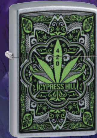
49010 STREET CHROME™ COLOR IMAGE $24.95

© 2019 Cypress Hill Musik. Under License to Epic Rights.