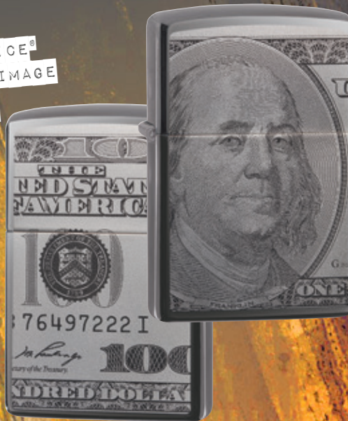
49025 BLACK ICE® PHOTO IMAGE $37.95

That's why currency is such a hot fashion & design trend right now. If they can't flaunt a stack of $100s, this Black Ice lighter Photo Imaged with a Benjamin on front and back is the next best thing.