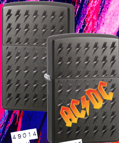
49014 GRAY ICED/COLOR IMAGE $39.95