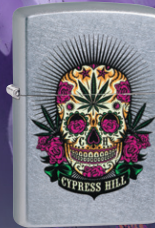
49011 STREET CHROME™ COLOR IMAGE $24.95