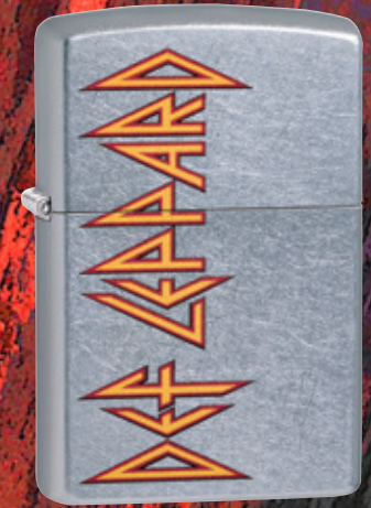
49009 STREET CHROME™ COLOR IMAGE $24.95

© 2019 Nomota LLC. Under License to Epic Rights.