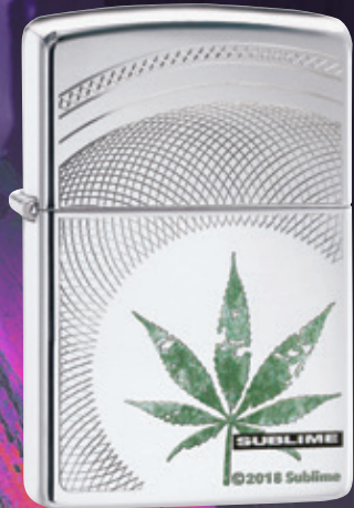
49016 HIGH POLISH CHROME COLOR IMAGE/ AUTO ENGRAVE $36.95